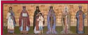
Fourth Grade Saints