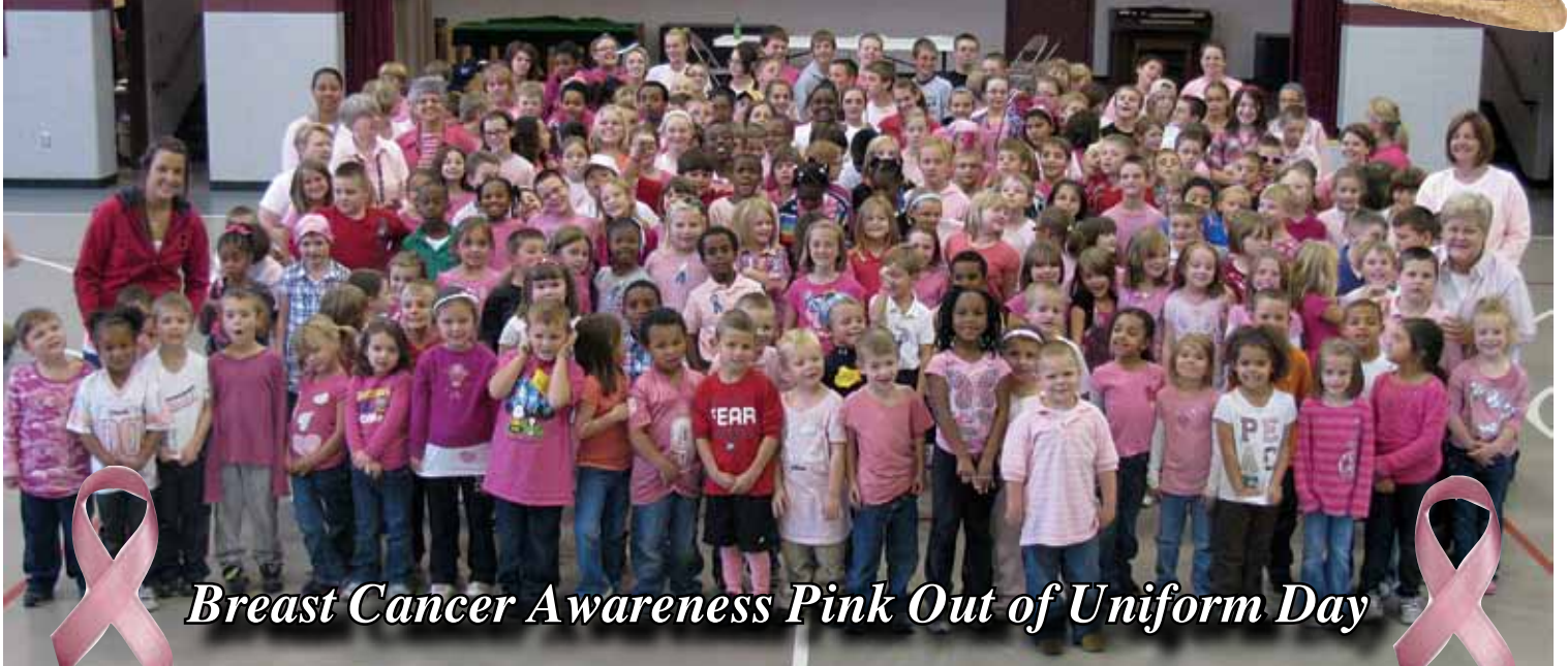
Breast Cancer Awareness Pink Out of Uniform Day