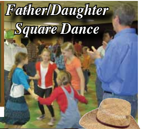
Father/Daughter Square Dance