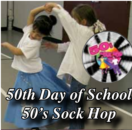
50th Day of School 50's Sock Hop